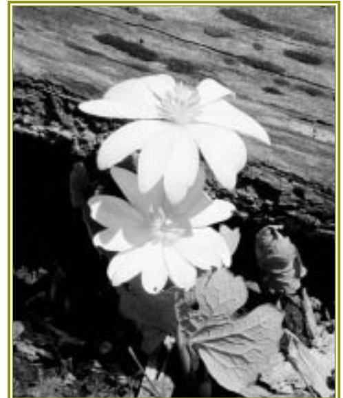
The native Bloodroot plant blooms regularly at SCEE during springtime

Last, but certainly not least, The Schuylkill Center announces its first annual Native Plant Sale, which will be held on Saturday, April 30th and Sunday, May 1st. In partnership with Redbud Native Plant Nursery, we feel it's important for the residents of the Philadelphia area to have an opportunity to buy native Pennsylvania plants. A variety of perennials, shrubs and trees will be available for