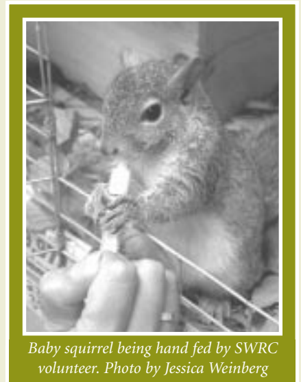
Baby squirrel being hand fed by SWRC volunteer.

Baby squirrels require a milk mixture of Esbilac and MultiMilk® (for increased fat content) for about 6-7 weeks, and then fresh greens are added. Around this time we also offer Purina Rodent Chow® to balance out their diet. This product was used for the first time last year and helps the Clinic increase the health of releasable squirrels.