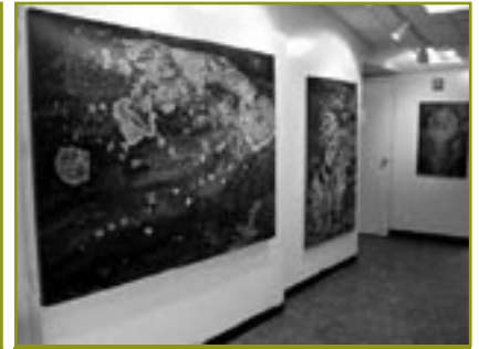
This abstract photographic exhibit runs from February 11th to May 30th, 2006 in SCEE's art gallery.

aspect of these landscapes has something in common with Richard Diebenkorn's paintings which I happened to be studying at the time."