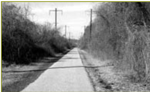
The entire southern side of SCEE's grounds, to the right of the path, borders approximately 2,800 feet of the Schuylkill River Trail.